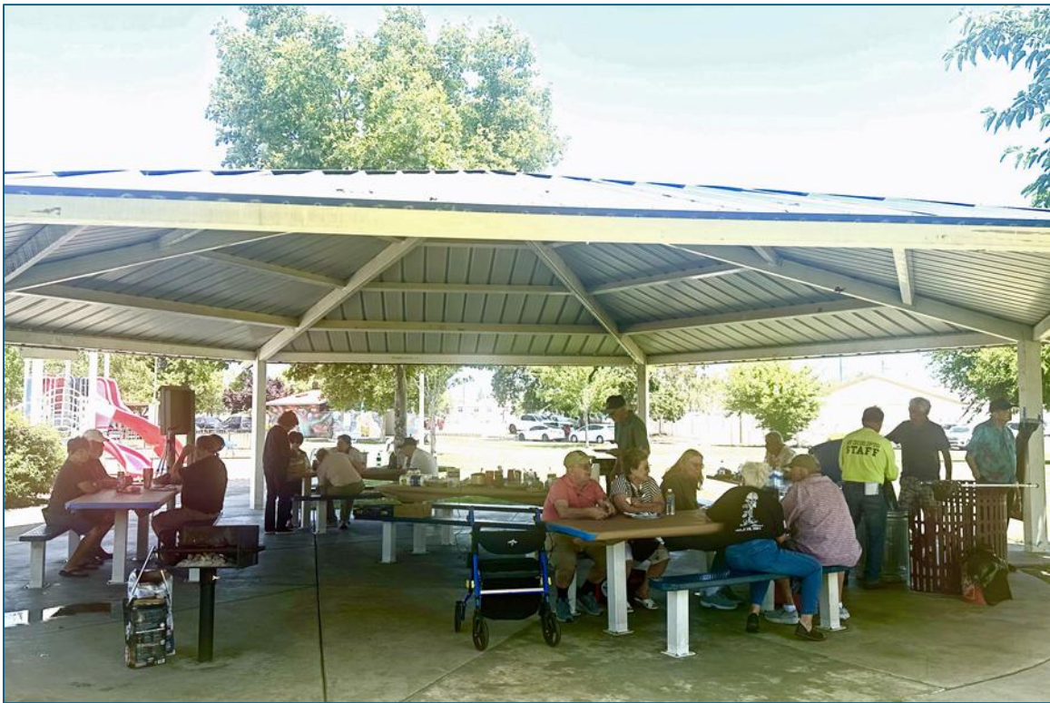
A different side of the Starfighter pavilion at Freedom Park