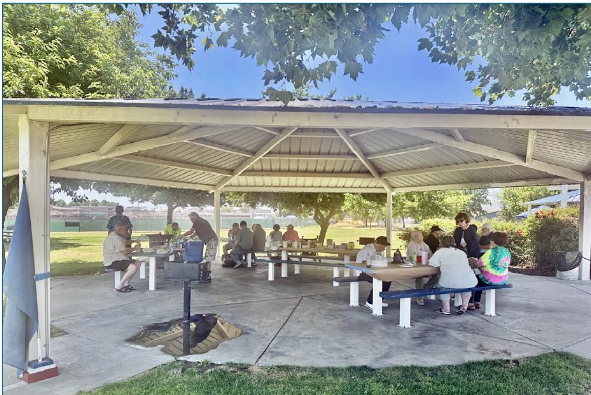
A side view of the Starfighter pavilion at Freedom Park (that is a US Air Force flag at the post on the left side.)