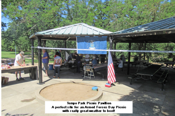
Tempo Park Picnic Pavilion A perfect site for an Armed Forces Day Picnic with really great weather to boot!