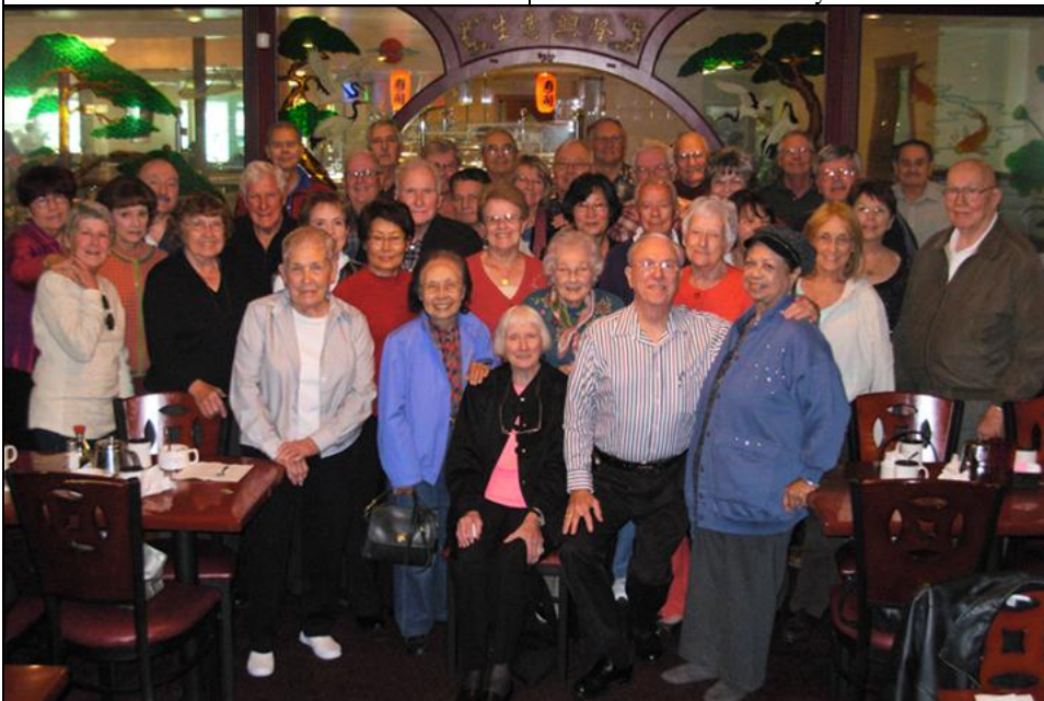
Thirty-eight Alumni + one guest, all of whom enjoyed this gathering & luncheon