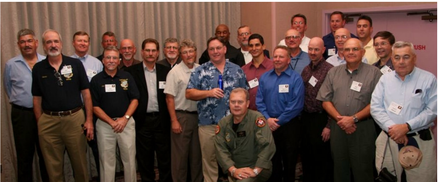
"Latter generation" attendees at the Airborne reunion.