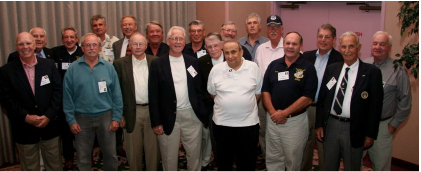
"Earlier generation" attendees at the Airborne reunion.